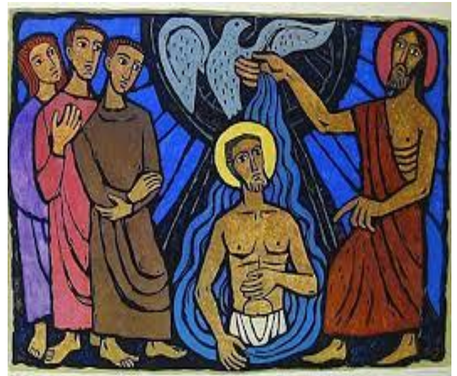
JESUS IS BAPTIZED AT THE RIVER JORDAN

In those days Jesus came from Nazareth of Galilee and was baptized by John in the Jordan. And when he came up out of the water, immediately he saw the heavens opened and the Spirit descending upon him like a dove; and a voice came from heaven, "Thou art my beloved Son; with thee I am well pleased." The Spirit immediately drove him out into the wilderness. And he was in the wilderness forty days, tempted by Satan; and he was with the wild beasts; and the angels ministered to him. Now after John was arrested, Jesus came into Galilee, preaching the gospel of God, and saying, "The time is fulfilled, and the kingdom of God is at hand; repent, and believe in the gospel."