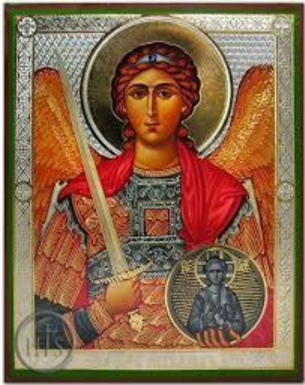
SAINT MICHAEL the ARCHANGEL Patron and Protector of the Church