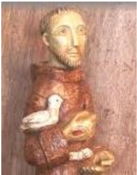
ST. FRANCIS OF ASSISI Patron Saint of Animals